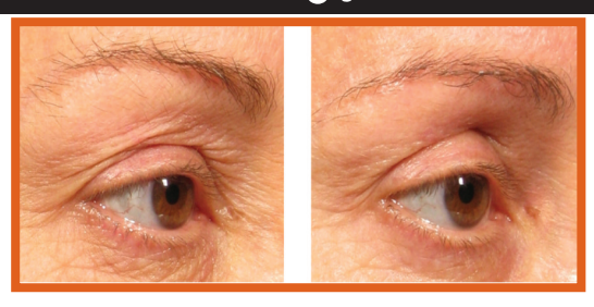
Upper Lid - Before & After

Popular and effective, Ulthera works on the deep dermis, remodelling and tightening to counteract the effects of time and gravity. It lifts the brow, reduces the excess skin on the lids, opens up the eyes and gives a more refreshed