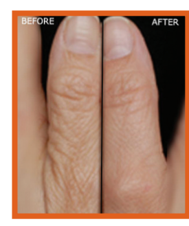
Hands Before & After